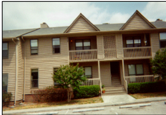
An Example of Wilmington Housing

After 5:00 p.m. and on weekends, keys may be obtained from the Medical Center switchboard.