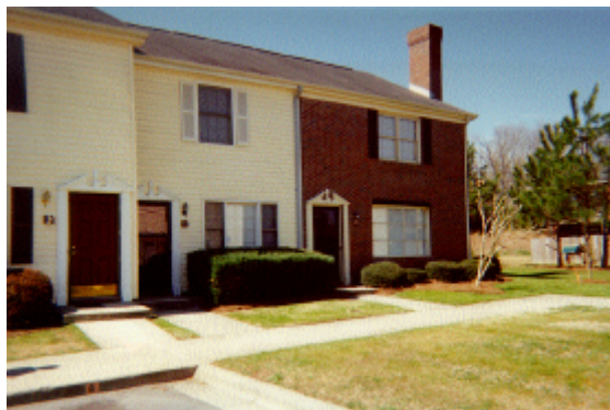
An Example of EAHC Housing