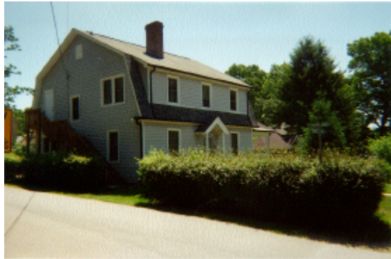
Some Examples of Mountain AHEC Housing In the city of Asheville

Kitchen: Every housing unit is furnished with a basic supply of salt, pepper, sugar, aluminum foil, soft soap, oven liners and burner bibs in addition to dishes and cooking utensils. The students are expected to replenish these supplies as they are used, leaving a basic supply for future residents.