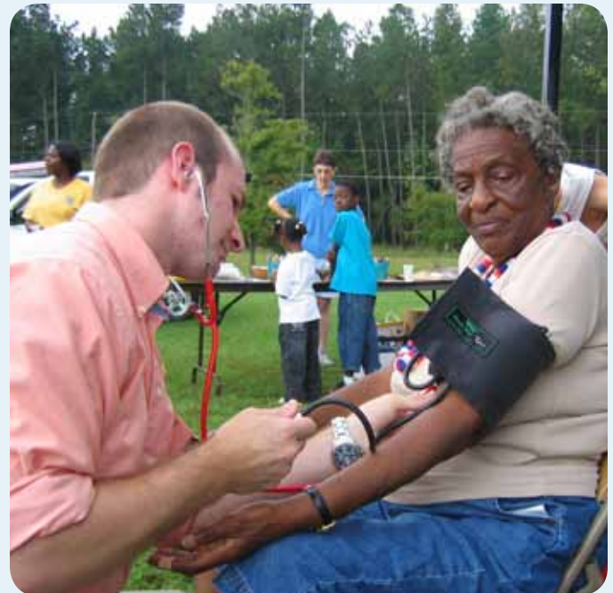
UNC medical student provides care during a local outreach project