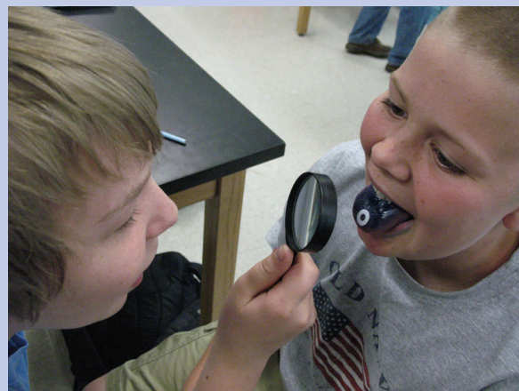
Middle school students at Martin's Creek School in Murphy, NC participate in the pharmacogenomics module by counting each others' taste buds.

The teachers were very excited to have DNA Day in their classrooms. One wrote ( Story continued on page 2 )