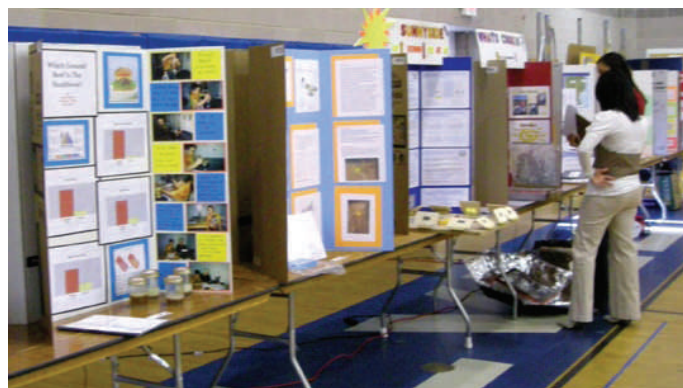
UNC PharmD students judging elementary projects