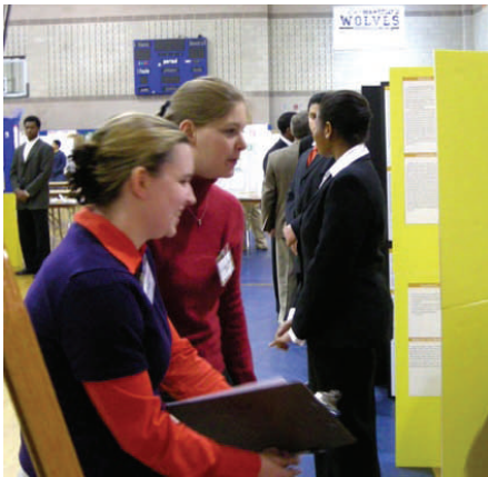
UNC judges going over a senior biology project.

The North Carolina Region 3 - Central Regional Science Fair was held at Wakefield Middle School in Raleigh on February 21, 2009. Participants from 11 counties, including Wake and Durham counties, competed in the elementary, middle school and high school levels.