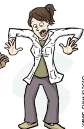
WRONG SIZE OR DID YOU GAIN WEIGHT?