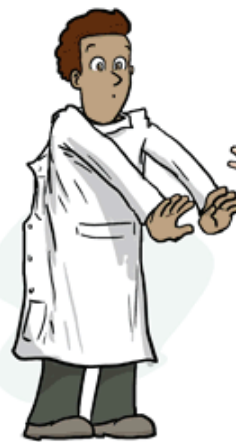
BACKWARDS ODD, BUT... KINDA MAKES SENSE?