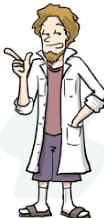
TOO COOL (TO USE THE BUTTONS)