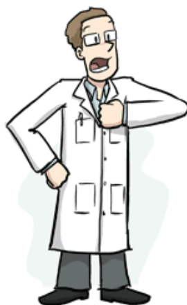
PRIM AND PROPER I AM... A SCIENTIST!