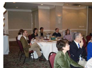
A good time was had by all as invited guests learned how to determine a good wine.