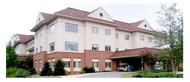
Carolina Meadows 100 Whippoorwill Ln, Chapel Hill, NC 27517 Accessible by Car Only