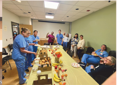
Pictures from various Holiday and staff appreciation events teammates enjoyed throughout the Children's Hospital this fall.