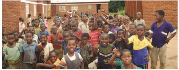
Students from Dzama Primary School

Donations are welcome through the UNC Health Foundation , the Dzama Malawi Fund .