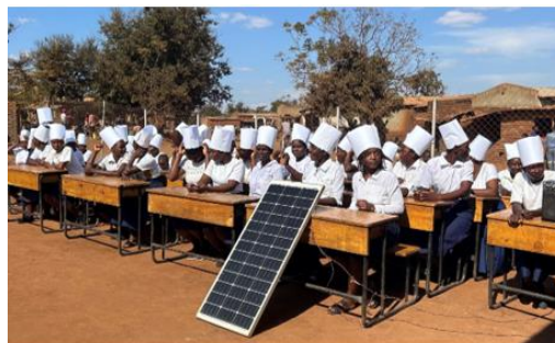
Literary class for young mothers in Dzama

Thanks to generous funding from donors, especially from UNC faculty and alumni and the CFAR community, the program has built 14 classrooms for both the primary school and the pre-school in addition to a water well, toilet facilities and teacher housing.