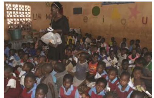
Students from Dzama Pre-School

Dzama is a rural subsistence farming community located in Lilongwe District Malawi where UNC Project-Malawi has most of its academic activities. The Dzama Education Development Program was founded in 2004 with the