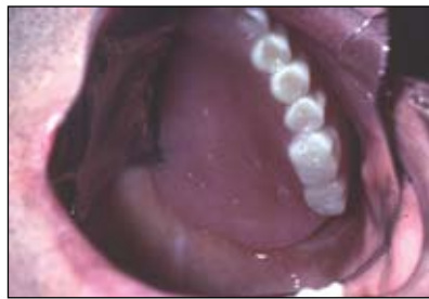
1. An obturator is used by a patient after maxillectomy.