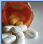
Prince died after accidentally consuming counterfeit Vicodin pills that actually contained fentanyl.

When fentanyl (or a fentanyl analog) is mixed with heroin, cocaine or other drugs, it is NEVER mixed evenly. Powder from one side of a baggie (or on one edge of a pressed tablet) may contain no fentanyl at all, yet powder from the other side may contain a fatal dose. This is called the “chocolate chip cookie effect” and is why it is important to test every bit of the drug you intend to consume.