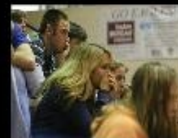
Students react to survivor's story