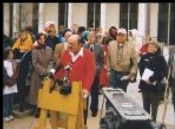
Laryngectomee day at the legislative building

Survivors and victims of tobacco-related diseases can and Should play significant roles in tobacco control advocacy efforts.