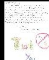
Thank you letters from fifth graders

SAVE: Survivors And Victims Empowerment A Model Program