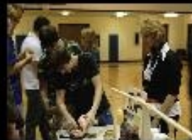
Students examine educational displays