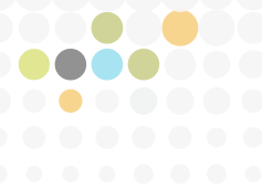
Table 2: Measurement Plan