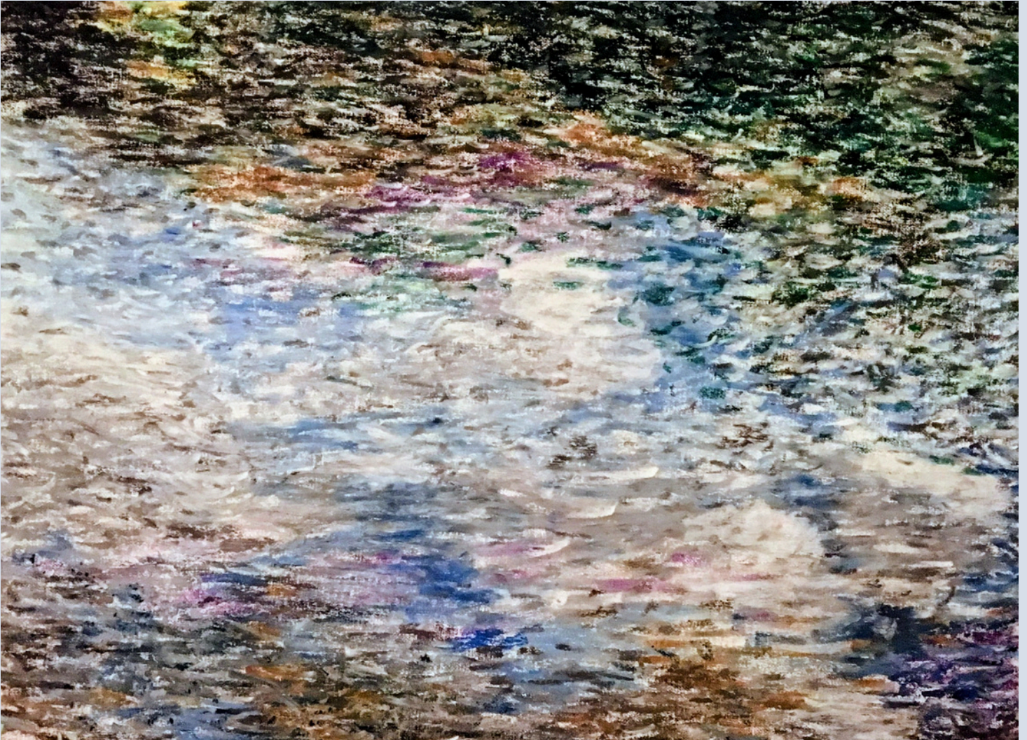
Oil pastel on canvas

This piece was completed in the impressionist tradition of en plein air. As part of a larger collection, Water reveals the immortality of textural and chromatic change in the natural world.