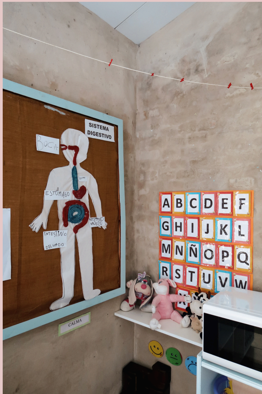
Digital photograph | Cerro Largo, Uruguay

While visiting a rural school in Uruguay, I encountered a classroom wall depicting the digestive system through the eyes of its youngest students. This piece reflects on the universality of learning and the continuity between art, medicine, and language, connecting my medical Spanish studies at UNC with the origins of curiosity found in childhood classrooms.