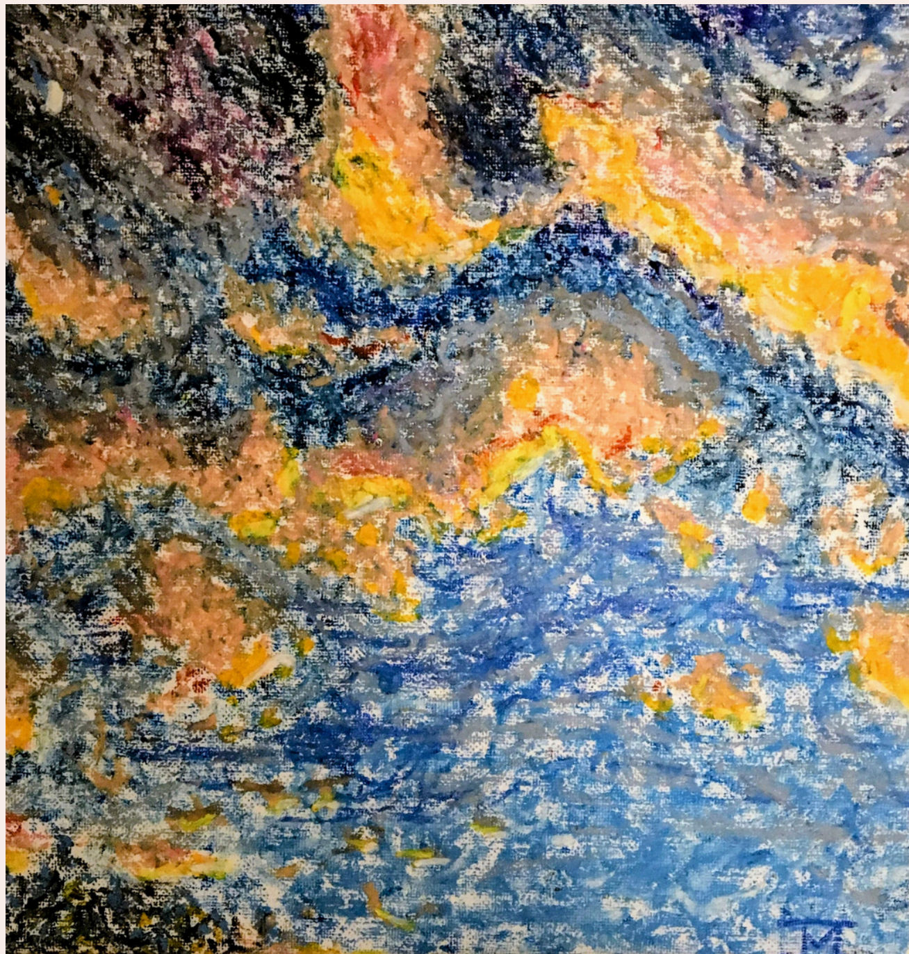
Oil pastel on canvas

Clouds was completed in the studio. As part of the same collection as Water , it serves as a reminder of the dynamic yet familiar horizon witnessed by universal spectators.