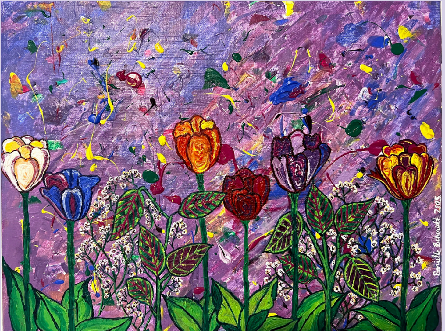
Acrylic paint on canvas

Violet Haze depicts a vibrant meadow of tulips and wildflowers emerging against a background of swirling purple splatters and abstract color. Inspired by a spring garden outside my research lab, the piece celebrates the quiet magic of flowers and the way they animate even the most ordinary spaces. It is a tribute to the color and vitality nature offers freely when we take a moment to notice.