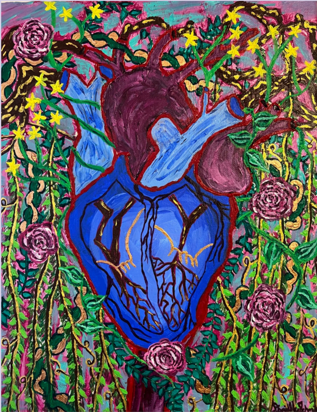
Acrylic paint on canvas

Inspired by the symbiosis between humanity and nature, this piece portrays flowers blooming from a human heart, reflecting their intimate, life-giving connection. It speaks to a cyclical relationship in which nature sustains us—through breath, nourishment, and beauty—while reminding us of our responsibility to nurture and protect it in return.