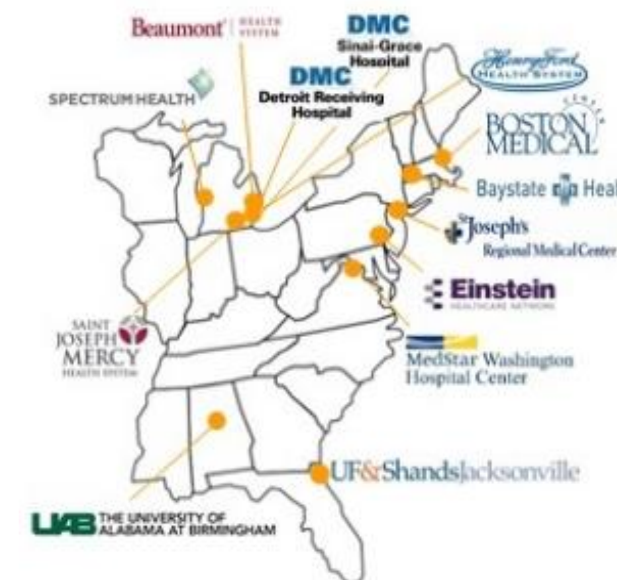
Figure 1: Sixteen ED Recruiting Sites and Coordinating Site (UNC)