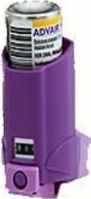
Advair HFA/Advair Diskus fluticasone/salmeterol