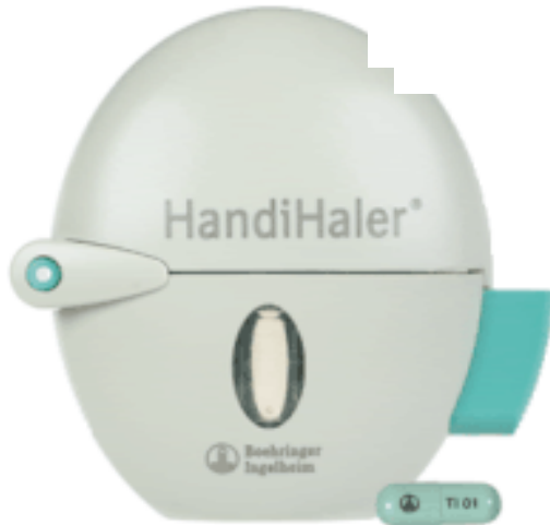
Spiriva Handihaler tiotropium bromide