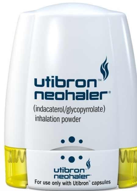
Utibron Neohaler indacaterol/glycopyrrolate