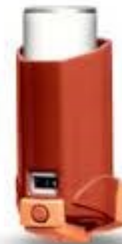
Flovent Diskus (fluticasone propionate inhalation powder)