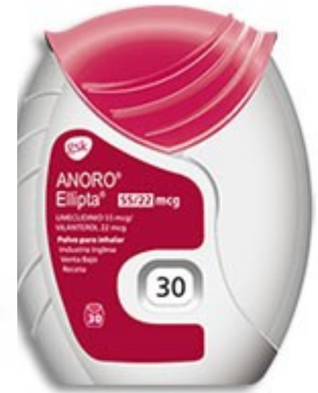
Anoro Ellipta umeclidinium/ vilanterol