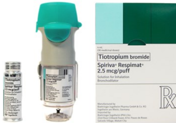
Spiriva Respimat tiotropium bromide