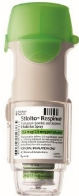
Stiolto Respimat tiotropium/olodaterol