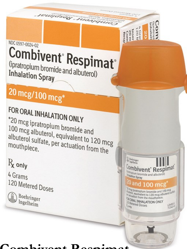
Combivent Respimat ipratropium/albuterol