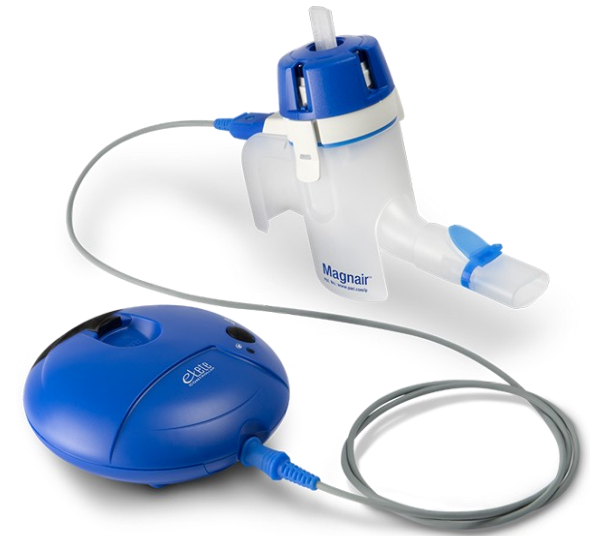
Lonhala Magnair glycopyrrolate