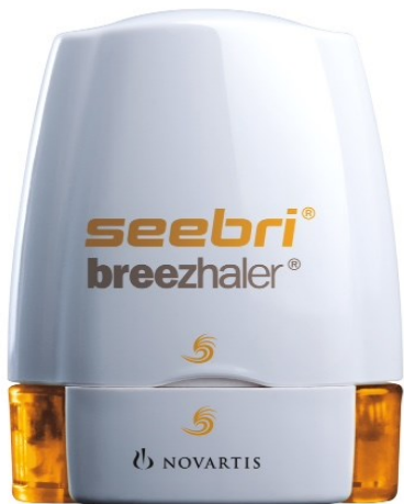
Seebri Neohaler glycopyrrolate