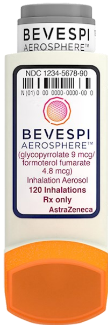
Bevespi Aerosphere glycopyrrolate/ formoterol