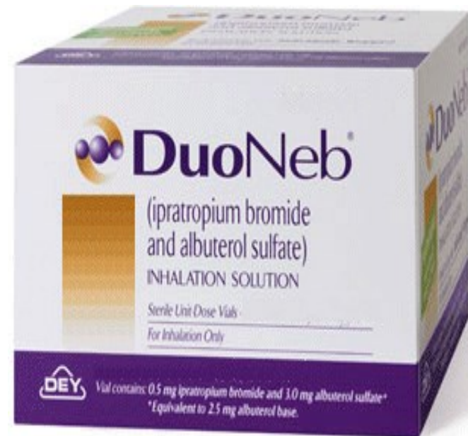
DuoNeb ipratropium/albuterol solution