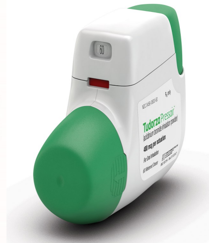
Tudorza Pressair acclidinum