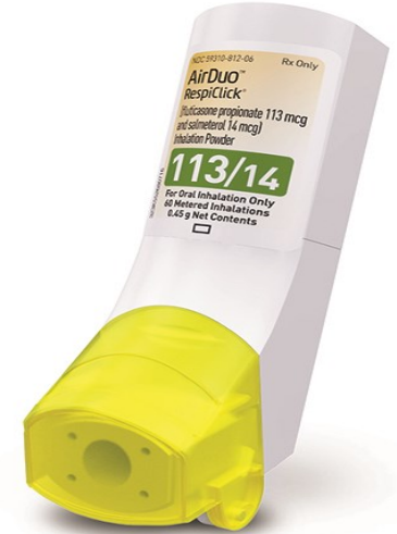
AirDuo Respiclick fluticasone/salmeterol