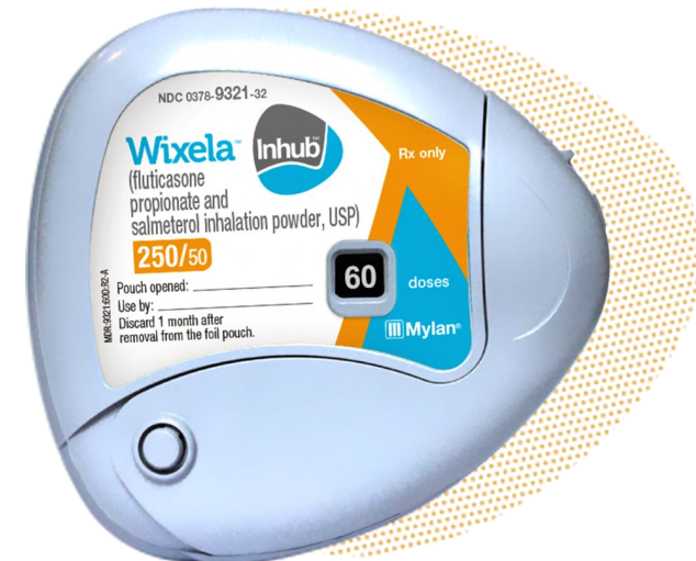
Wixela Inhub fluticasone/salmeterol