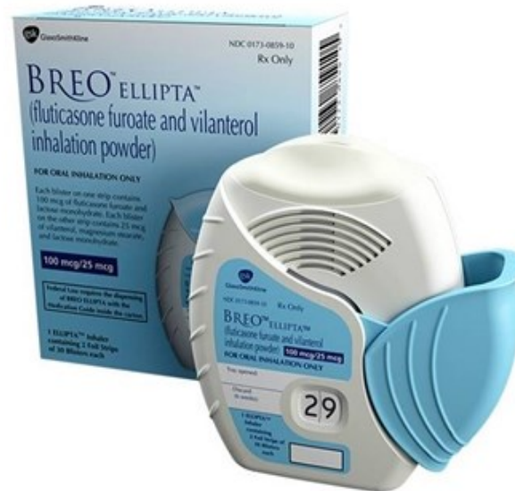
Breo Ellipta fluticasone/vilanterol