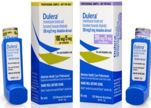
Dulera mometasone furoate/ formoterol