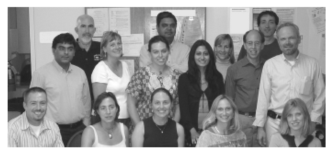
The staff members and volunteer board members of Child Family Health International (summer 2005).