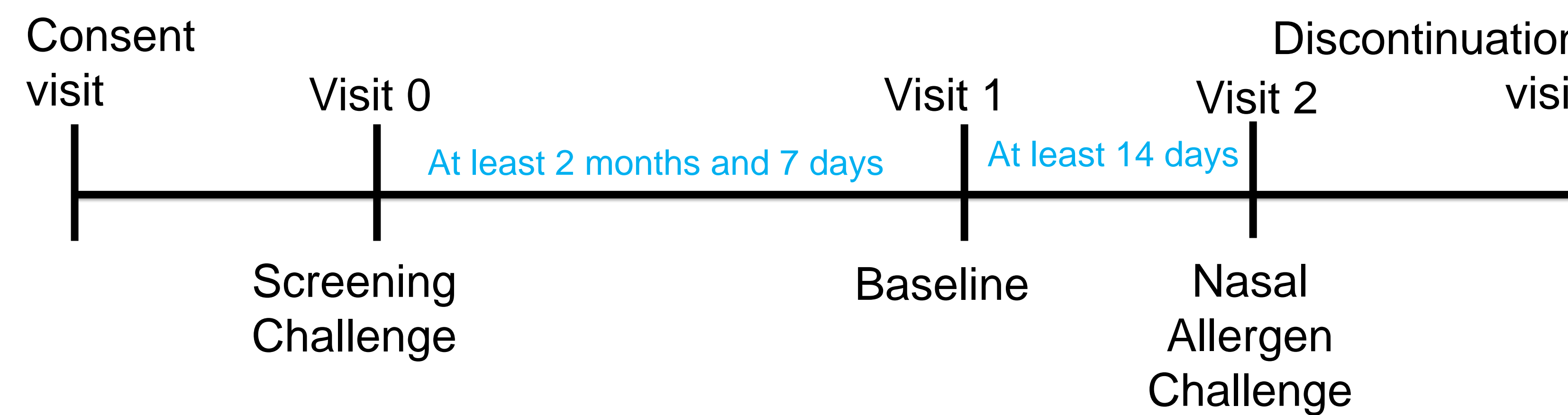
Figure 2. Study Design