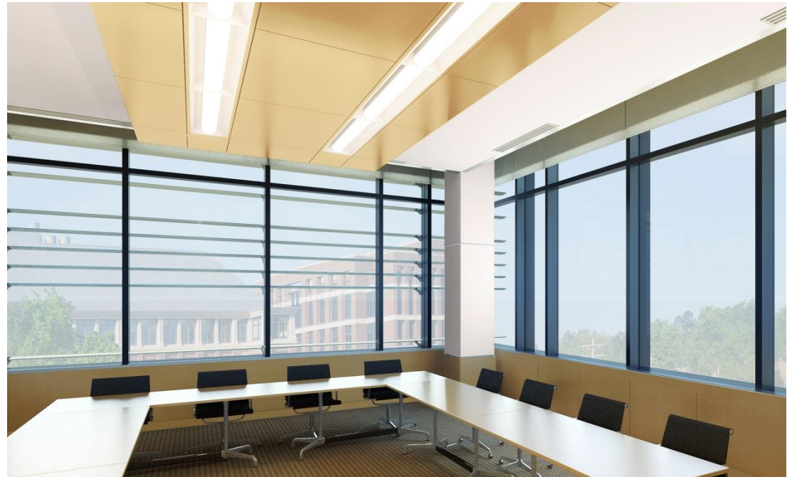
TYPICAL CONFERENCE ROOMS on each floor