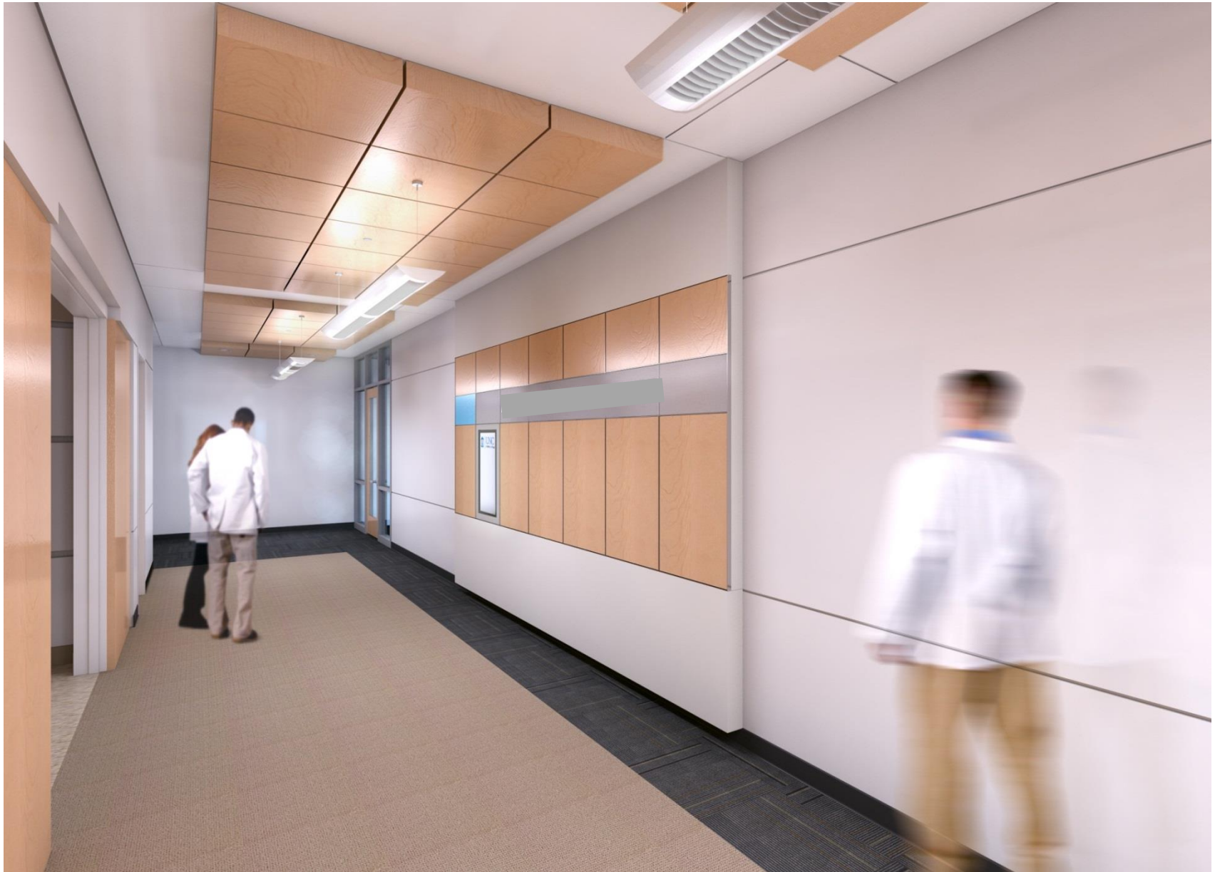
FLOOR CORRIDOR leading to lab entrances