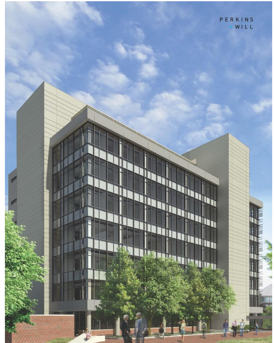
NW View walking from MBRB, Taylor Hall