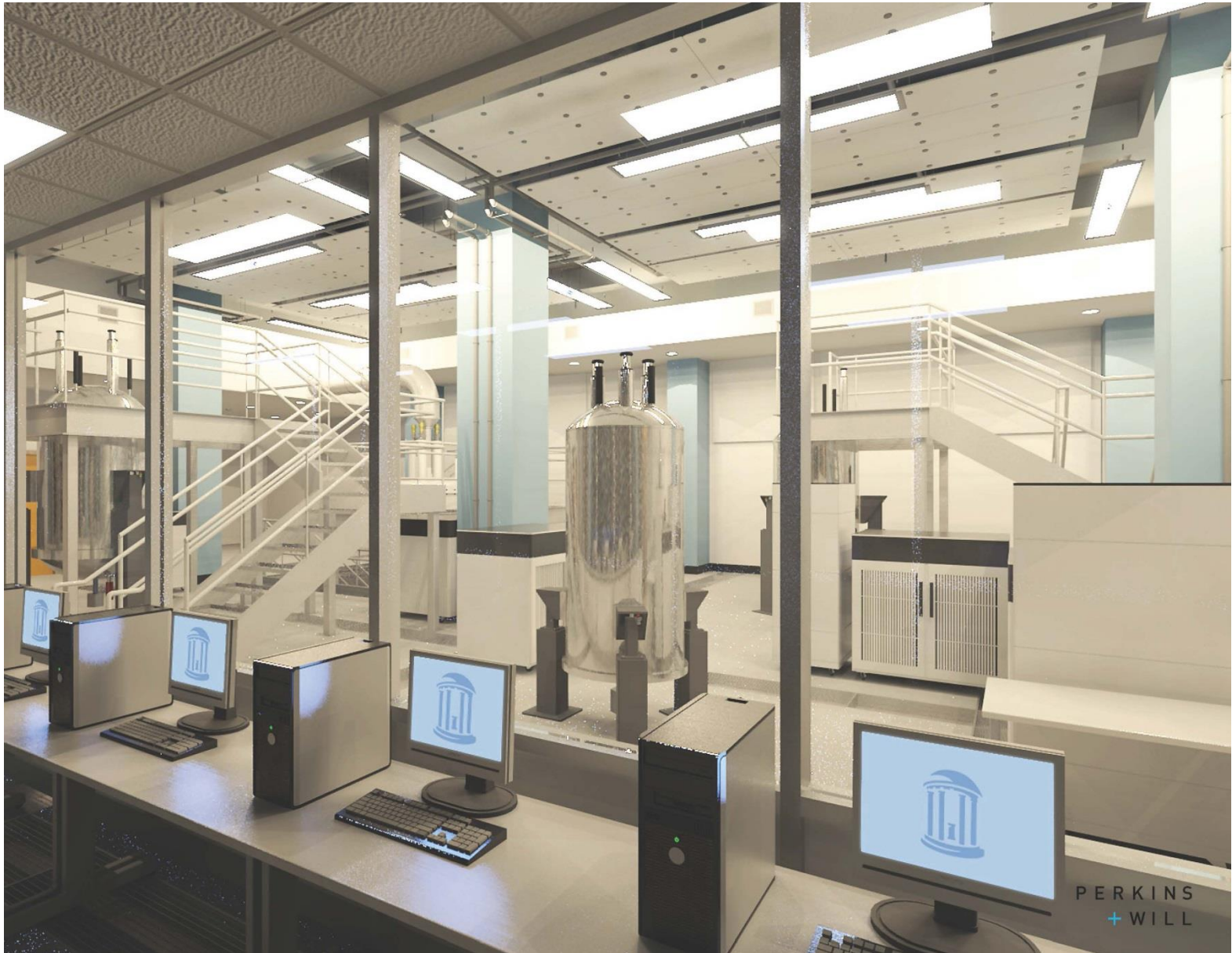
NMR FACILITY Sub Basement level