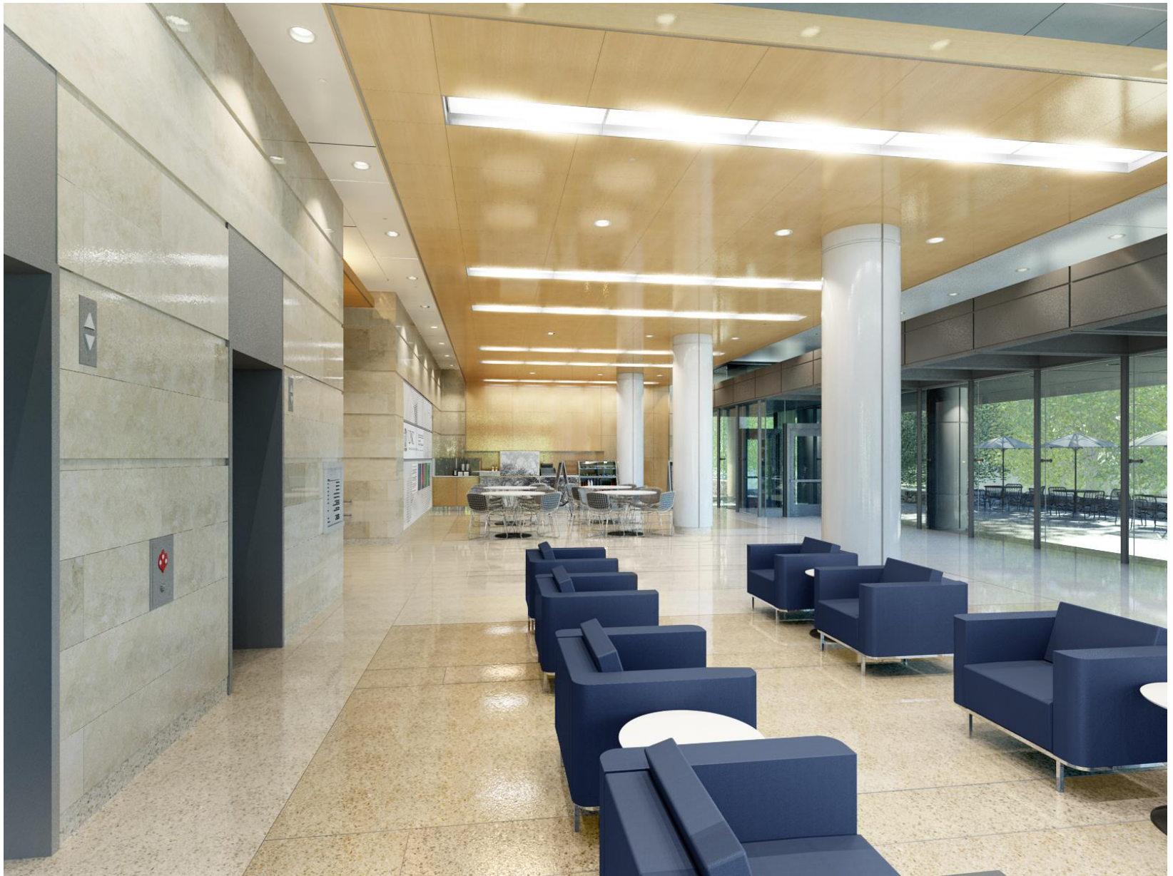
MAIN LOBBY entrance across from Taylor Hall. Elevators at left, coffee shop ahead.