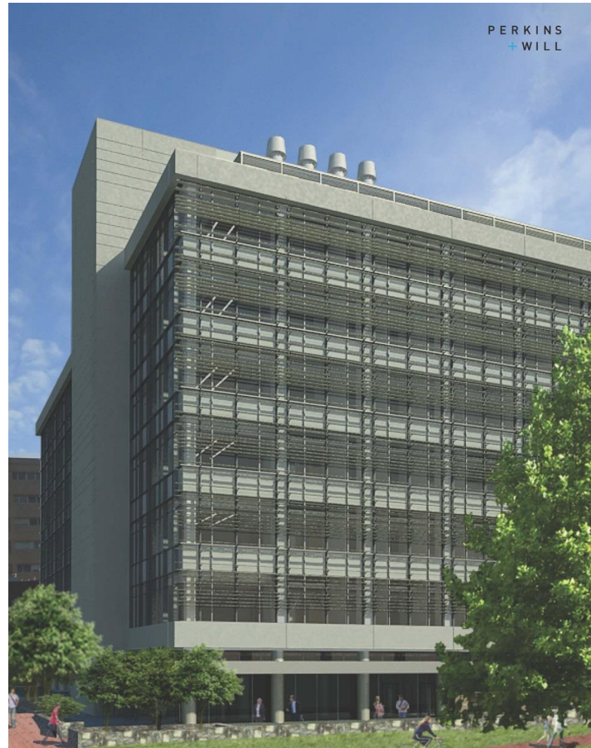
SW View from Mason Farm Rd

Size is similar to Genetic Medicine 7 occupied floors above ground + 2 below Usable SF per floor = 25,000 $260 million capital project