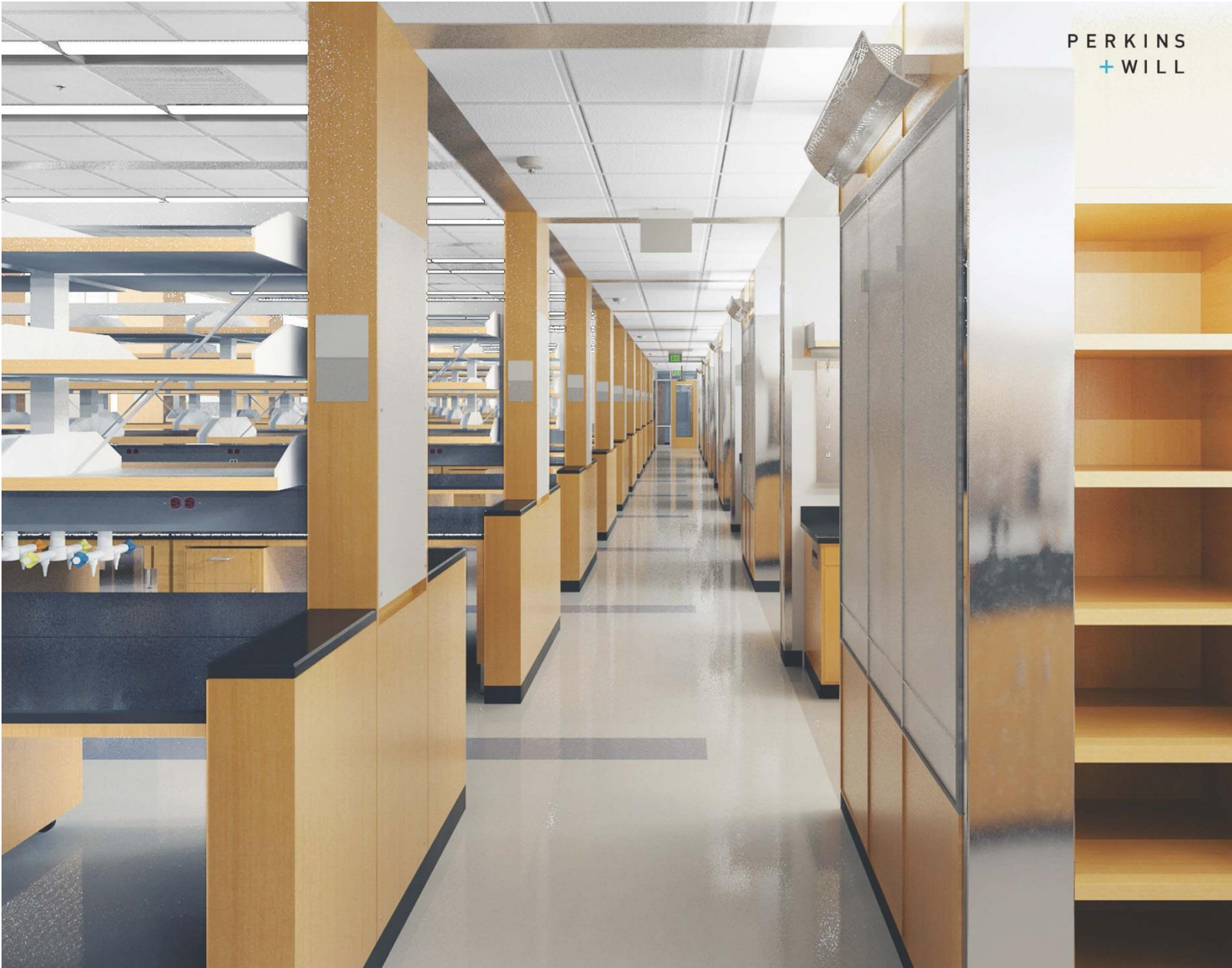
TYPICAL LAB CORRIDOR between lab bench and interior support areas