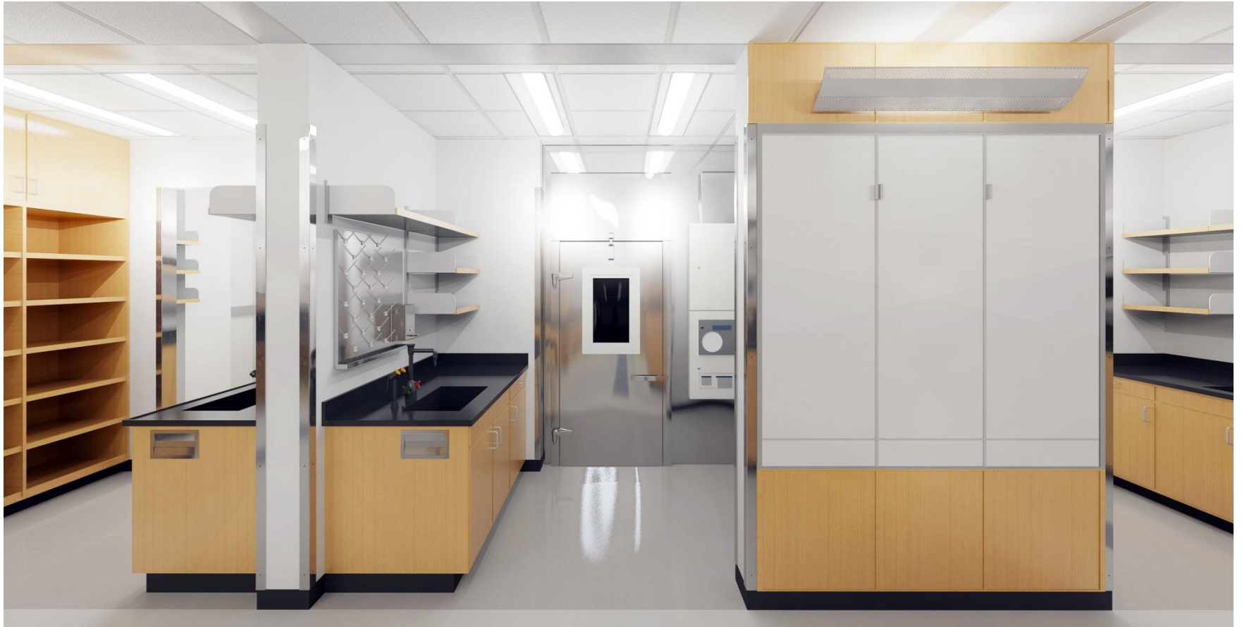
TYPICAL LAB SUPPORT including cold room, across corridor from lab benches