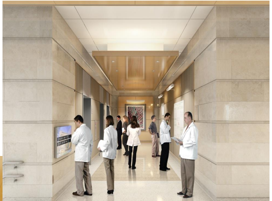
MAIN ELEVATORS AND STAIRCASE, ground floor lobby up to floor 1