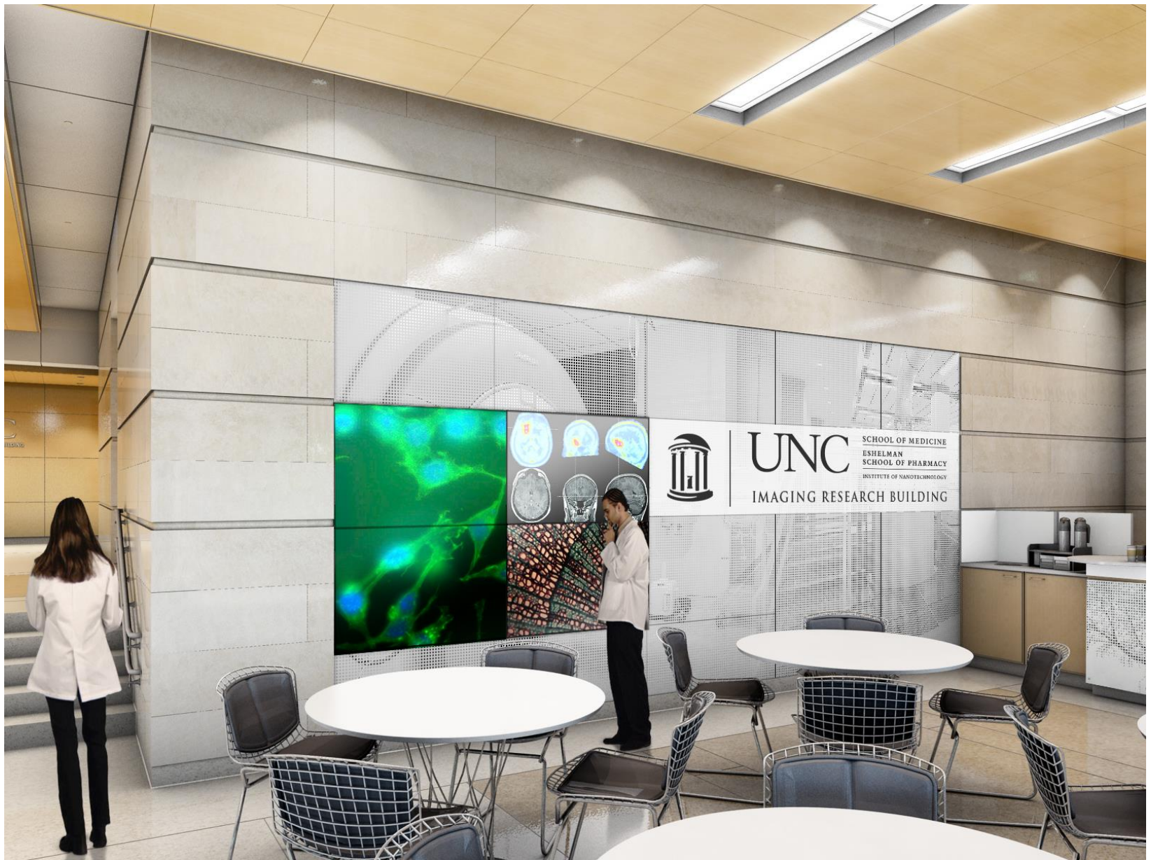
MAIN LOBBY Coffee Shop, stairs at left to first floor