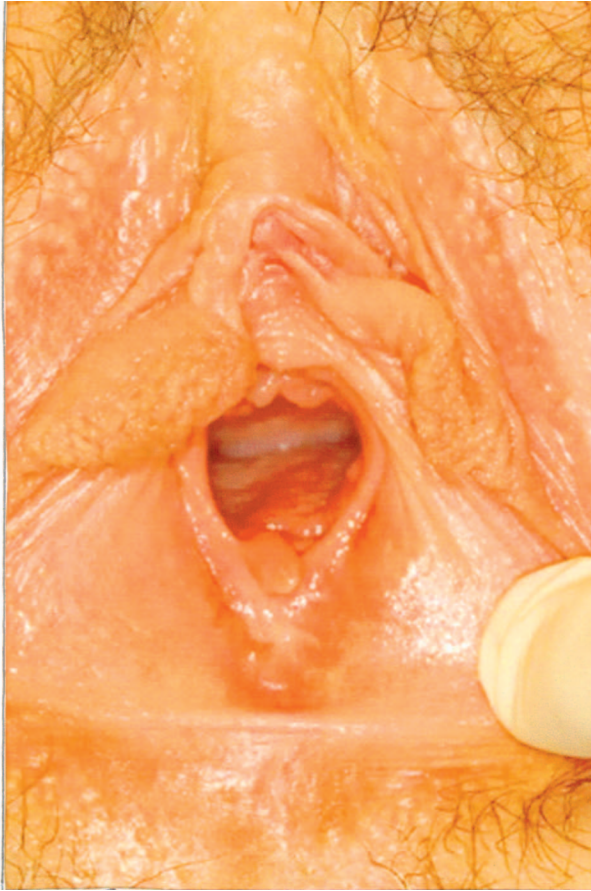
Fig. 2. Photograph of vulvar vestibular syndrome. Steege. Evaluation and Treatment of Dyspareunia. Obstet Gynecol 2009.

drome often develop significant emotional reactions to having the disease, extensive research has failed to demonstrate any preexisting psychiatric or emotional condition as a precursor to developing the disorder. Rather, it seems more likely that there may be a genetically determined intrinsic vulnerability to inflammatory processes. 4 Given this vulnerable substrate, superimposed provocative stimuli such as vaginal infection, long-term use of low-dose oral contraceptives, 19 or intercourse beginning before the age of 16 may then be causative.