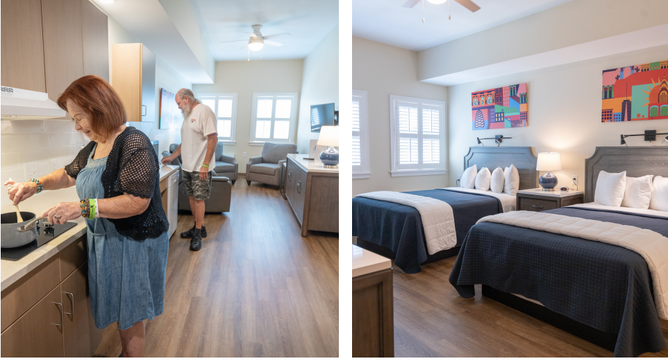
16 suites with a separate bedroom, complete kitchen, and sitting area. Sleeps up to 4 $72/night posted rate