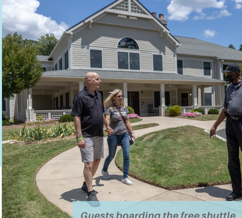
Guests boarding the free shuttle

Family House guests are afforded not only lodging but are also offered complimentary meals, supportive & entertainment programs, transportation to the hospital, and a caring support network.